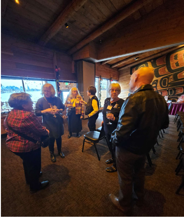
Visiting with old friends