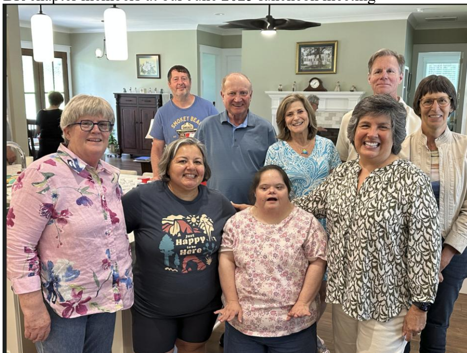
BR chapter members at our June 2025 luncheon meeting

Below are the photos from that gathering.