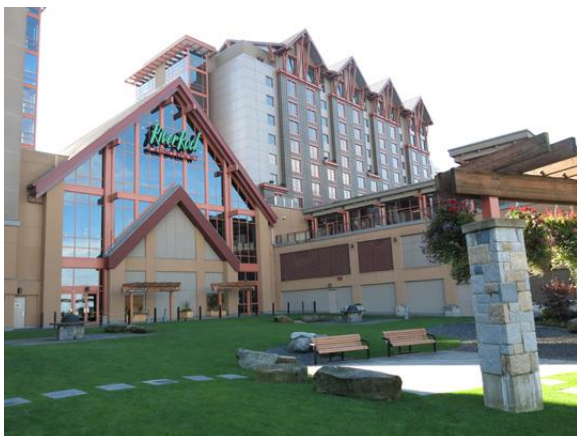
River Rock Resort Casino

Most CRA delegate and their spouses from across the USA and Canada are expected to fly into Vancouver International Airport. Here are some brief notes from Adams regarding the easy transportation accessibility to the meeting hotel: