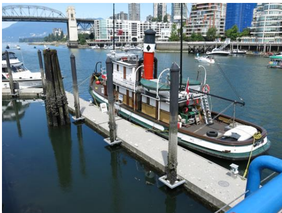
Granville Island Waterfront

Unlike other primped and pruned parks around the world, Stanley Park is a temperate rainforest wrapped by the Pacific Ocean on three sides. Moreover, the park boasts 27 kilometers of forested trails, a 10-kilometer seawall, two swimmable beaches, three restaurants, rose and rhododendron gardens, a pitch and putt golf course and an open-air summer theatre. Birdwatchers come from around the world to see the local Great Blue Heron nesting colony. AND, not to be overlooked, Stanley Park also is home to the world-famous VANCOUVER AQUARIUM.