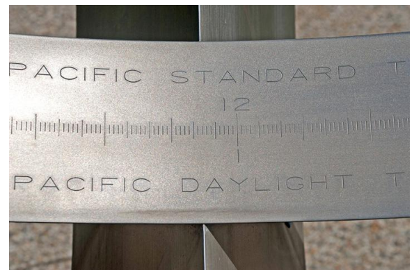
Time markings

The Heliochronometer's new home is physically situated within the Corporation's main campus quadrangle just outside Building A. Situated in a garden setting with walkways it is a very accessible, popular and attractive location to employees and or visitors.