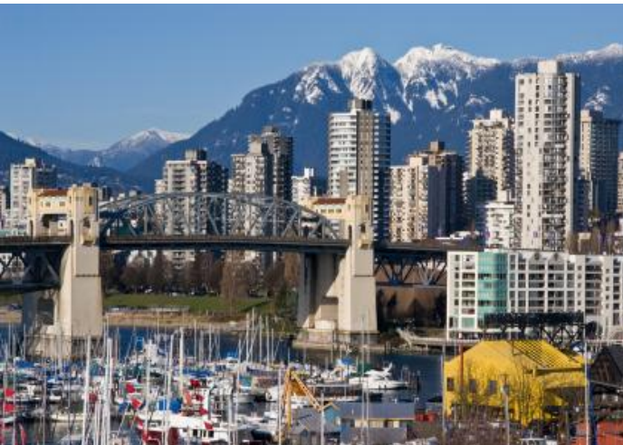
Burrard Bridge; downtown Vancouver

Celeste Regalado (Princess Cruises) 800-901-1172 ext. 41664 or cregalado@princesscruises.com . Be sure to contact Celeste directly so you can be registered with our group.